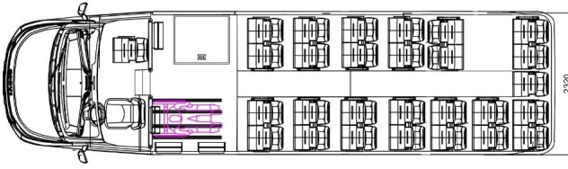
Attachment 1 - Seats - Scheme