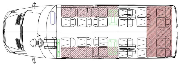
Attachment 1 - Seats - Scheme